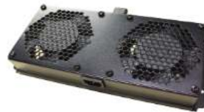
FME-FANS Dual 4" Fan Assembly 120VAC