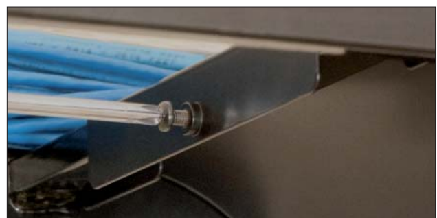
Tighten one screw