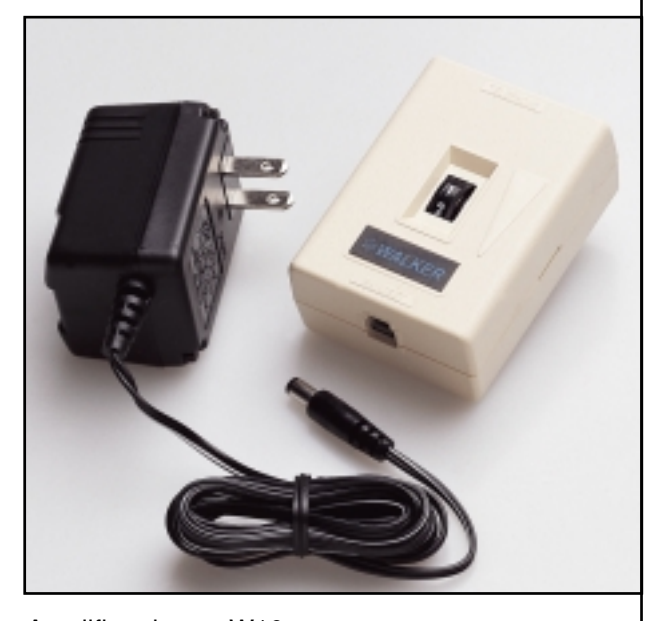
Amplifier shown: W10

The W10 series boost the receiver volume over three times the normal level, making hard-to-hear calls easier to hear.