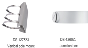
DS-1275ZJ Vertical pole mount