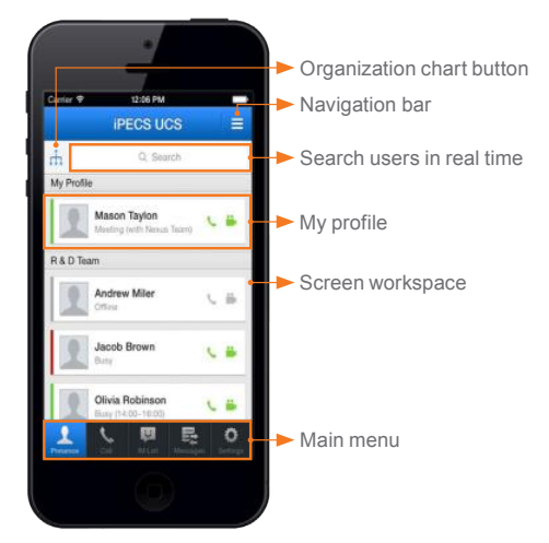
iPECS UCS Mobile Client for iOS