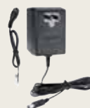
PRS2403 24V DC Power Supply