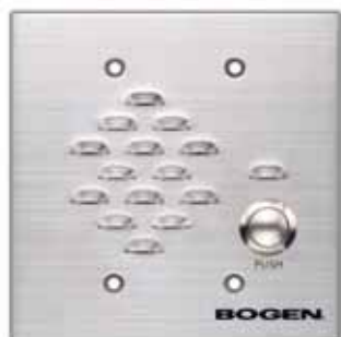
Shown without bezel frame