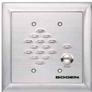
Shown with bezel frame (Included)