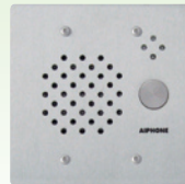
IE-SS Stainless Steel Flush mount