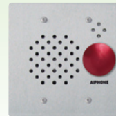
IE-SSR Stainless Steel with red mushroom call button Flush mount