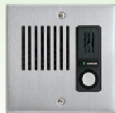
IE-JA Stainless Steel faceplate Flush mount