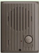
IF-DA Plastic cover Surface mount