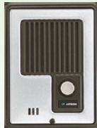
IE-DC Plastic and aluminum cover Surface mount