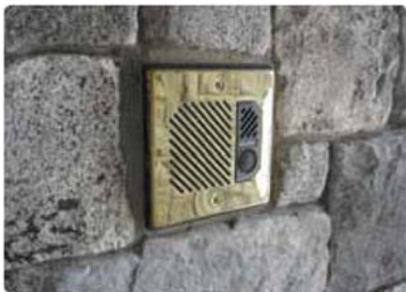
Flush-Mounted 8028 SIP Doorphone using Brass Faceplate