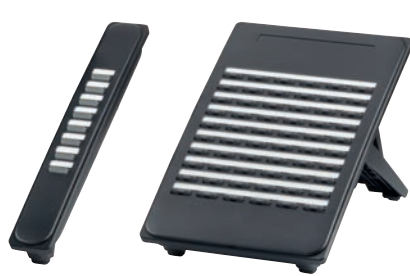
8LK & 60-DSS add-on modules