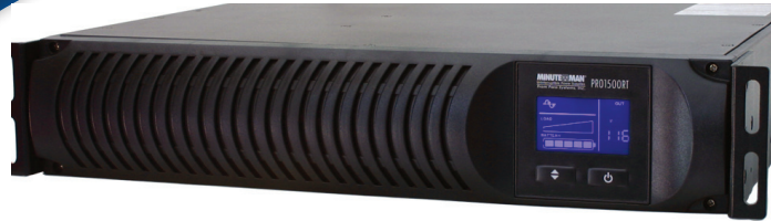
PRO1500RT - 1500VA/1050W Line Interactive UPS