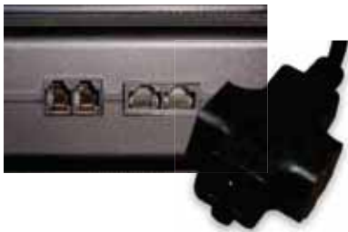
Total protection solution

Power, phone, and data lines are all protected by the versatile FilterPro, with protector topology compatible with POTS, ADSL, 10/100BaseT, and GigE.