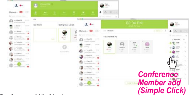
Audio Call & Conference (Win/Mac)