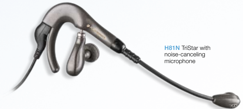
H81N TriStar with noise-canceling microphone

Get ultimate sound quality on traditional PBX phones, IP phones and wideband IP phones by combining your Plantronics TriStar headset with our latest corded amplifier—the Vista M22 with Clearline™ audio technology.