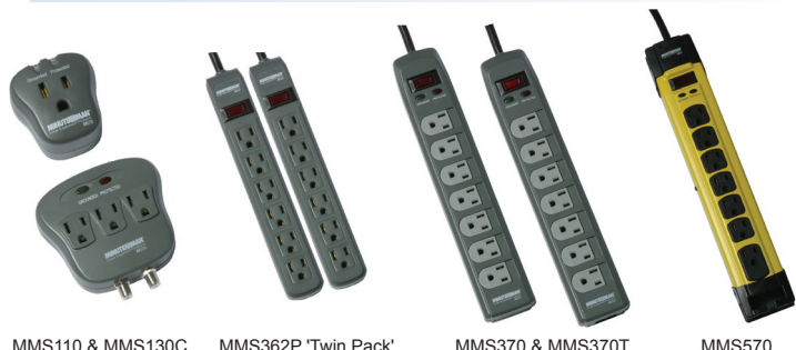
MMS110 & MMS130C