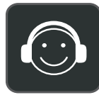
All Day Wearing Comfort